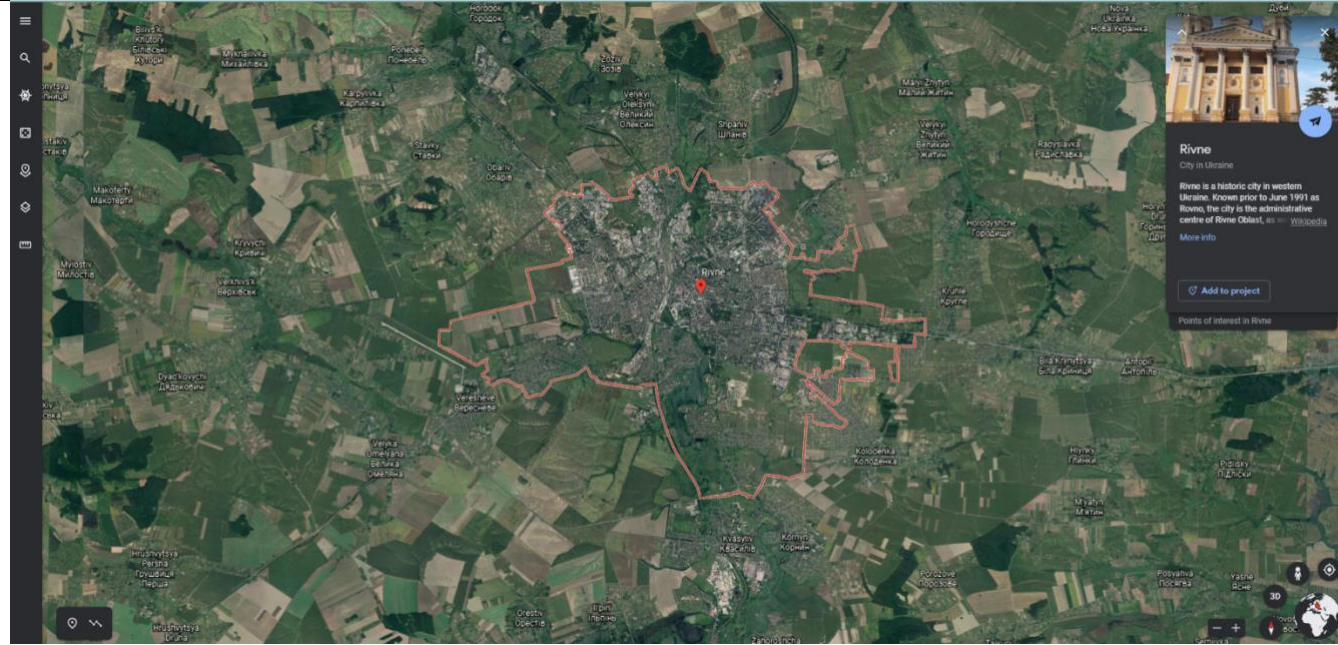
The picture above is what students see when they enter Rivne into Google Voyager within the program Google Earth.

End products, outputs. What will the students produce during this lesson/project? Be as specific as possible, and if the final product is different in each school please tell us what students in each class are producing.