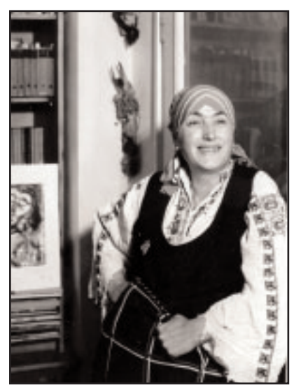
This is a photo of a scene of my famous one-man performance 'Pizho and Pendo' by Elin Pelin, staged at the Army Theater, Sofia. The photo was taken in the 1960s.

[1] Expulsion of the Jews from Spain: The Sephardi population of the Balkans originates from the Jews who were expelled from the Iberian peninsula, as a result of the 'Reconquista' in the late 15th century (Spain 1492, and Portugal 1495). The majority of the Sephardim subsequently settled in the territory of the Ottoman Empire, mainly in maritime cities (Salonika, Istanbul, Izmir, etc.) and also in the ones situated on significant overland trading routes to Central Europe (Bitola, Skopje, and Sarajevo) and to the Danube (Edirne, Plovdiv, Sofia, and Vidin).