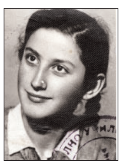
This is a photo of me as a schoolgirl. The photo was taken in Sofia in 1943, before the internment of my family and I from Sofia to Haskovo and Dupnitsa. Then I had taken up playing the violin. I started going in for theater a little bit later - when we came back home after our internment; that is after 9th September 1944 [the communist takeover in Bulgaria].

I was happy on 10th November 1989, although I keep my left views. But I gradually got aware of the fact that we go from a certain lie to another. I am still sorry for the totalitarian period because one could do everything then, despite the immense difficulties that I encountered. And now one just has to