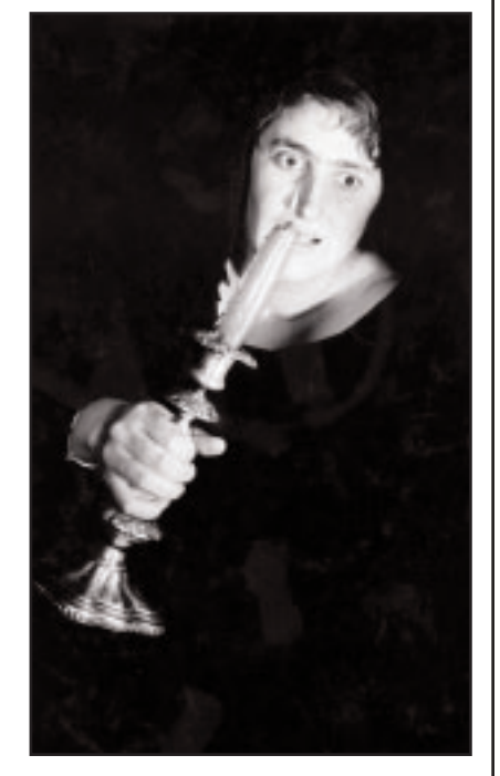
This is a photo of me in a spectacular scene of the one-man performance 'Daemon' by Lermontov, completed in 1957 for the Army Theater in Sofia.

[20] Law for the Protection of the Nation: A comprehensive anti-Jewish legislation in Bulgaria was introduced after the outbreak of World War II. The 'Law for the Protection of the Nation' was officially promulgated in January 1941. According to this law, Jews did not have the right to own shops and factories. Jews had to wear the distinctive yellow star; Jewish houses had to display a special sign identifying it as being Jewish; Jews were dismissed from all posts in schools and universities. The internment of Jews in certain designated towns was legalized and all Jews were expelled from Sofia in 1943. Jews were only allowed to go out into the streets for one or two hours a day.