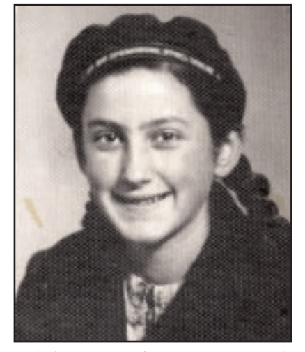
This is a photo of me as a schoolgirl. The picture was taken in Sofia in the 1940s.

I have to tell you a funny little anecdote in regard to this: My maternal grandmother didn't like much my other grandmother because she had abandoned