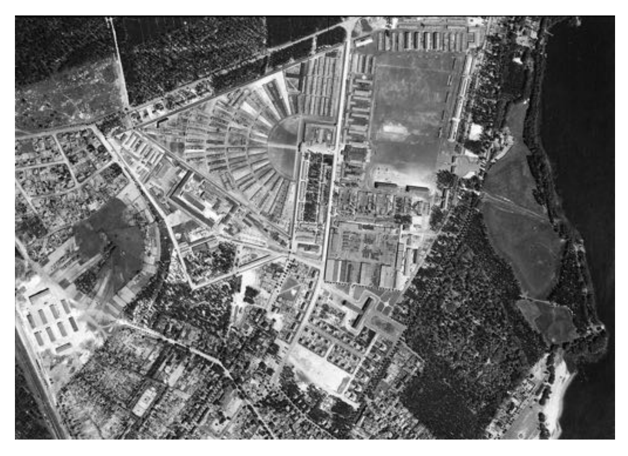
Image: Aerial photograph of Sachsenhausen, taken by the British Royal Airforce in May 1943. (Attribution: public domain)

Cover image: Imre Kinszki in Budapest, c. 1920s.