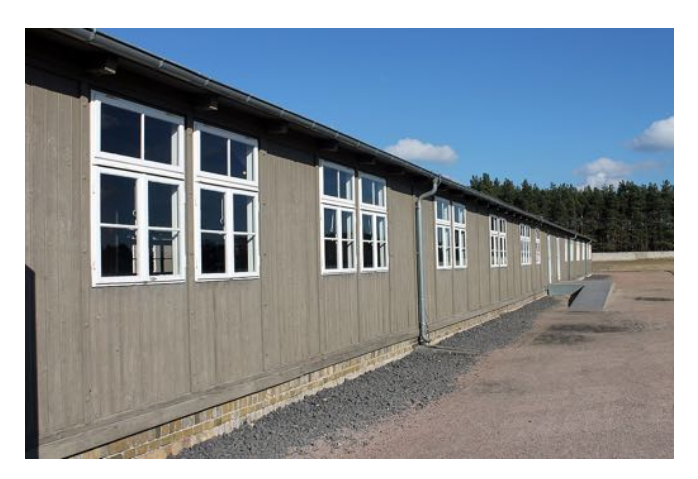
Image: Barrack 39 in Sachsenhausen Concentration Camp Memorial, 2014.

Sachsenhausen. Holocaust Encyclopedia. https://encyclopedia.ushmm.org/content/en/article/sachsenhausen