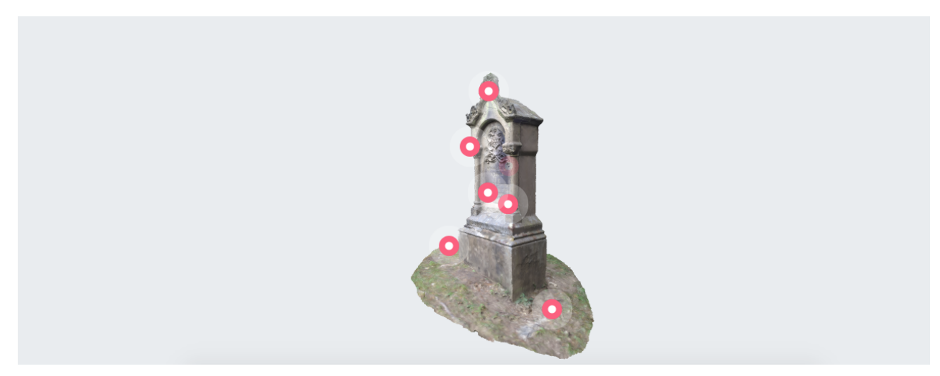
Figure 2: The 3D model of a Jewish tombstone uploaded on ThingLink and integrated with hyperlinks

On the Sketchfab repository I accessed the free photogrammetric model of a <u>Jewish tombstone</u> from the <u>Jewish Cemetery of Unsleben, Germany</u> (you can see the photo of the gravestone <u>here</u>), I <u>uploaded the model on ThingLink</u> enriching it with hotspots to ignite the students' observation and analysis skills, then I gave them a test to take on <u>Google form</u>. The quiz's good results proved the efficacy of the whole learning experience.