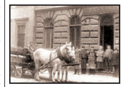
The soda-water workshop of Ilona's paternal grandfather

The nursery was ready in a very short time. Most of the leaders of the Jewish community of Budapest came to the opening and people came from abroad too. When the inauguration was over, the district ceremony's speak-