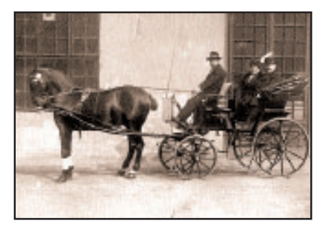
Ilona's grandparents on their carriage. At Ilona's grandfather's they had several coaches, both open and closed ones, which they went out in.