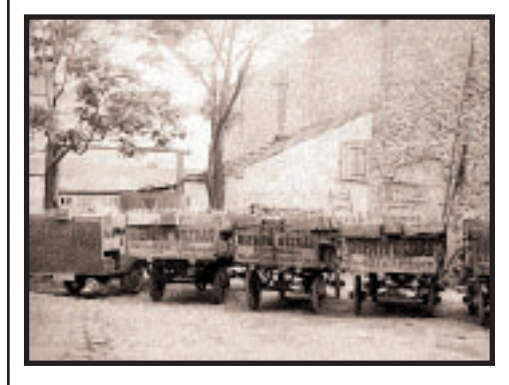
The soda-water wagons of the workshop of Ilona's father